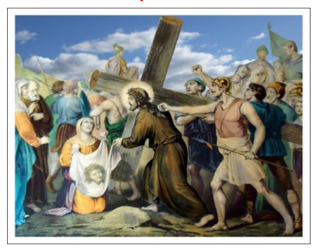
Sixth station The Veronica wipes the Face of Jesus

All: We adore Thee O Christ and we bless Thee. Because by Thy Holy Cross Thou hast redeemed the world, and me a poor sinner as well. (strike breast)