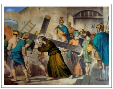
Second station Jesus is laden with the Cross

All: We adore Thee O Christ and we bless Thee. Because by Thy Holy Cross Thou hast redeemed the world, and me a poor sinner as well. (strike breast)