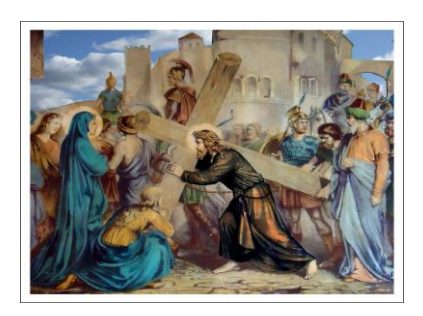
Fourth station Jesus meets His Most Holy Mother

All: We adore Thee O Christ and we bless Thee. Because by Thy Holy Cross Thou hast redeemed the world, and me a poor sinner as well. (strike breast)